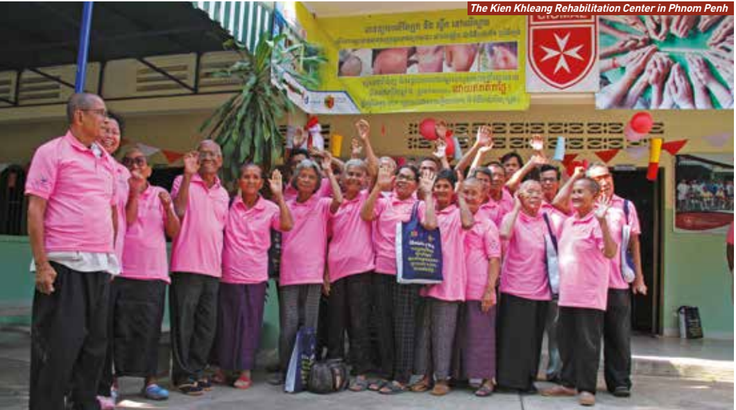
The Kien Khleang Rehabilitation Center in Phnom Penh

For the 66th World Leprosy Day, the CIOMAL Foundation organised an open house morning in Phnom Penh on 30th January.