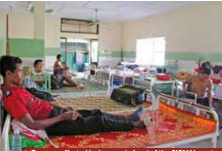
Persons affected by leprosy in front of the CIOMAL center