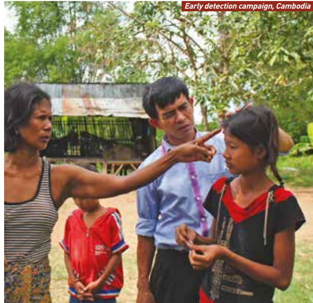
Early detection campaign, Cambodia

In the same year, the Kien Khleang center provided 5,611 people (including 1,373 children) with free dermatological consultations . More than 758 persons affected by leprosy were treated, including 166 patients who received surgery. Its rehabilitation programmes helped 38 families secure microcredit , as well as 32 school children and 6 students receive scholarships . In addition, awareness-raising activities reached 56,610 garment workers in 12 factories.